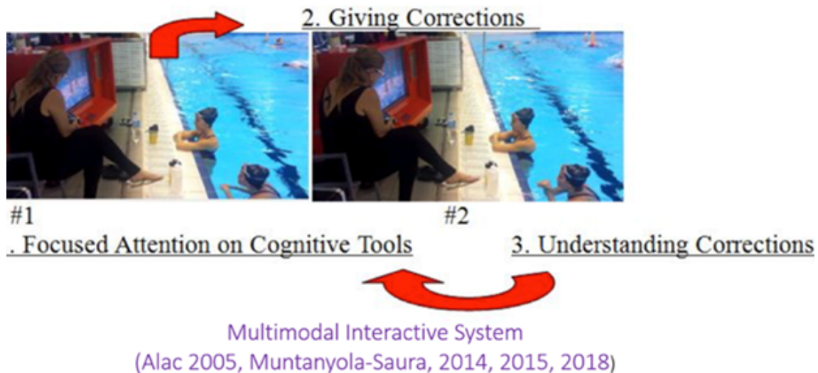
Figure 2. Examples of artistic gossip in physiotherapy, dance and synchronized swimming