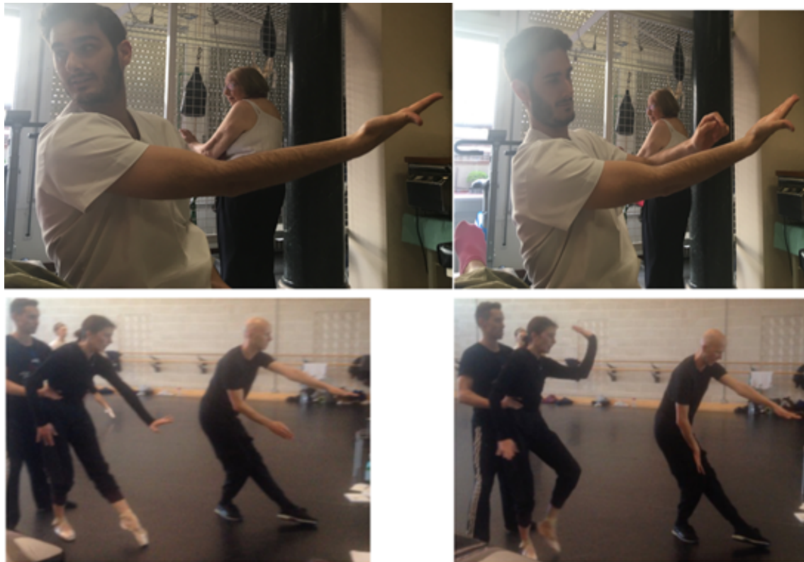
Figura 5. Marcaje del coreógrafo con el brazo. Atomos. Sadlers Wells. London. 2014

Moreover, Cicourel's work emphasizes the importance of integrating micro and macro levels of analysis in sociological research (1981). He argues that each level has its own organization, and that earlier levels of biological evolution enable subsequent, more complex levels to emerge. However, these evolved levels cannot be reduced to earlier ones despite their interdependence. This approach is crucial for understanding how social interaction and cognitive processes are intertwined in daily life.