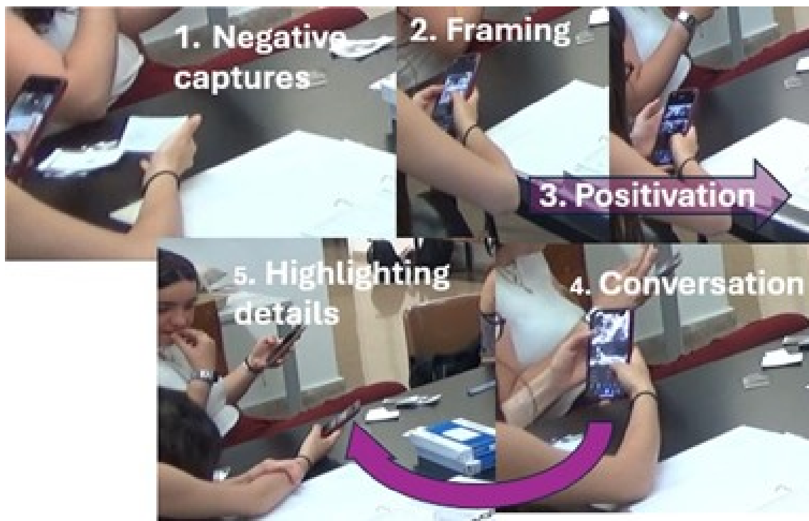
Figure 5 An example of artistic gossip in photography: A multimodal communication system

My own work applies Cicourel's integrated model to artistic work. Following cognitive sociology, every social definition involves a cognitive operation. I gather as well interdisciplinary models from cognitive science: distributed cognition (Cicourel, 2007, Lozares, 2007, Muntanyola-Saura, 2016), situated and enactive cognition (Kirsh, 2024,