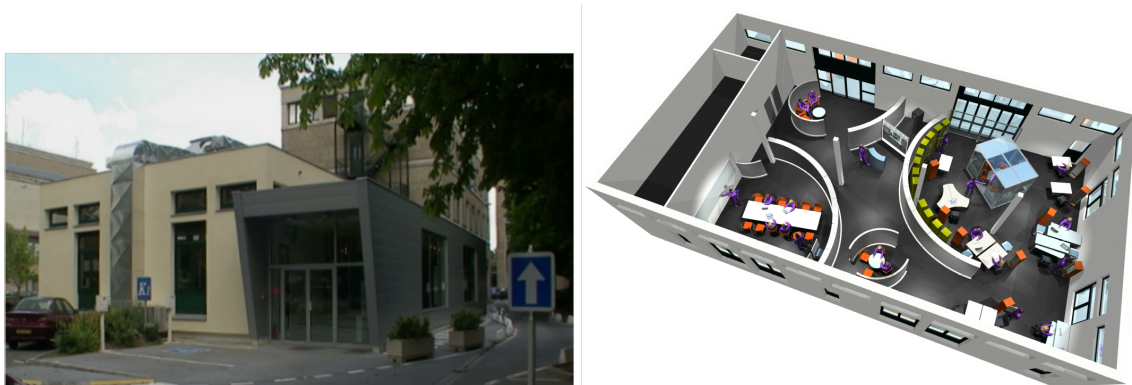
Figure 1: Outside envelope and partial floor plan of the K1 building housing the LDC, 2000.

The LDC experimented, tested, and disseminated in this vast organization that is EDF, the historic power operator, the new (at the time) information technologies, such as wifi, nomadic workstations, videoconferencing, virtual machines, RFID, telework etc.